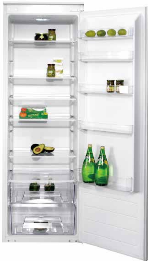
Built-in Larder Fridge:BIF177A