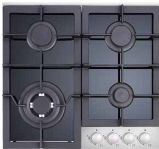
Glass Gas Hob:UBGHD60GG