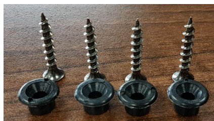
Oven Fixing Kit part number 25400155.