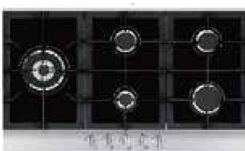
Glass Gas Hob:AGHD90GG