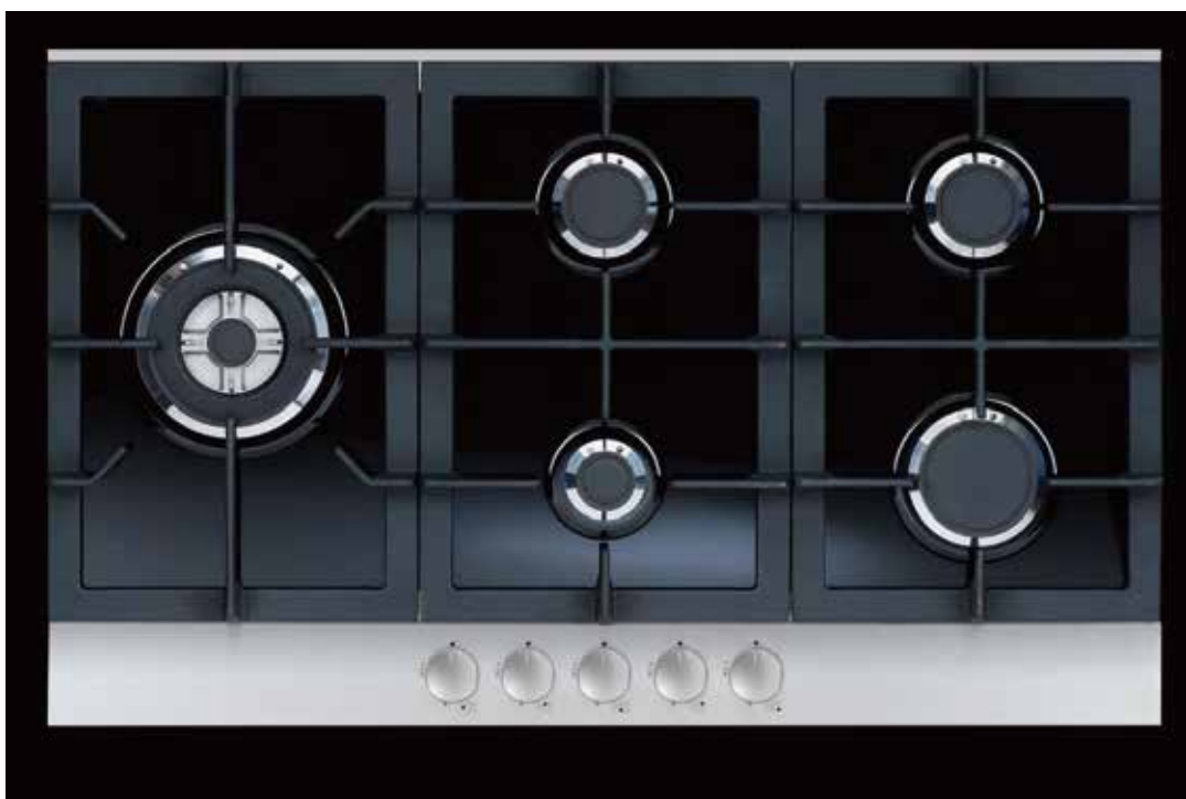
Glass Gas Hob:UBGHD90GG